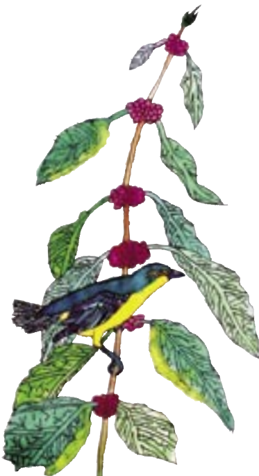
Arts in Action Student, Grade 4

Art from World Cultures: presents hands-on lessons inspiring students to explore new worlds and view life from another perspective.