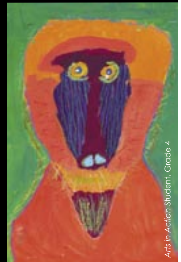
Arts in Action Student, Grade 4

- TEACHER MEADOW HEIGHTS SCHOOL SAN MATEO, CA