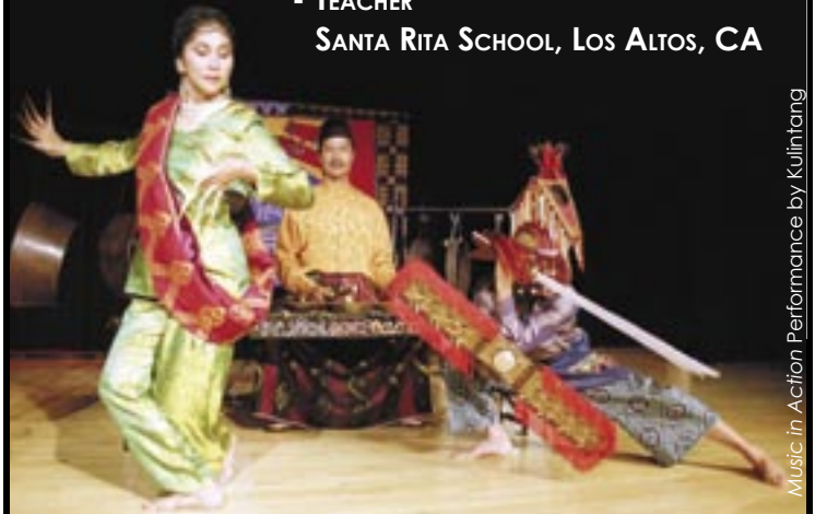
Music in Action Performance by Kulintang

- TEACHER SANTA RITA SCHOOL, LOS ALTOS, CA