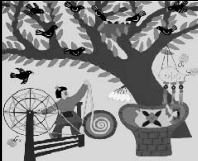
Jinshan Peasant Painting