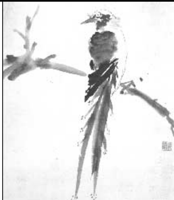
Brush Painting Study by HuaTao Zhang

GATHER SUPPLIES: Pointed brushes, black watercolor, tempera, scissors, paper, tissues, fabric, glue, tape & markers