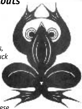
Paper Cut by Wang Zigan

Chinese artists cut intricate silhouette paper shapes for decorations, gifts & good luck charms. They hang them on windows, walls & doors. Try making your own Chinese Paper Cutout using lightweight paper.