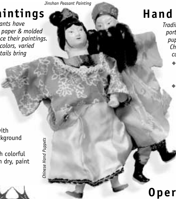
Chinese Hand Puppets