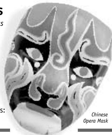
Chinese Opera Mask