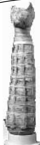
Cat Mummies and Coffin Egypt, Late Period-Ptolemaic, (525-30 BC) Wood, cat mummy, H: to 45 cm

Ancient Egyptians kept cats as pets & revered them as a symbol of the goddess Bastet. After a cat died, it was mummified, carefully wrapped in linen & preserved in a cat-shaped wooden coffin to accompany them to the afterlife.