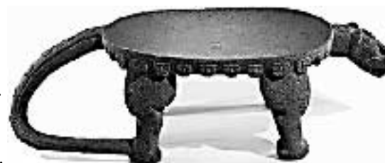
Guapiles, Limon, Costa Rica; Metate in the Form of a Jaguar, 600-700 Stone; 118.1 x 54.7 cm.; Cantor Arts Center at Stanford University 1966.76 www.museum.stanford.edu

Read a pet adoption ad. Write & illustrate your own.