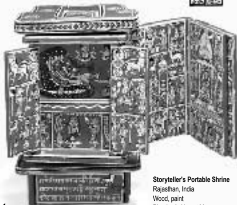
Storyteller's Portable Shrine Rajasthan, India Wood, paint Phoebe A. Hearst Museum of Anthropology (9-11105)