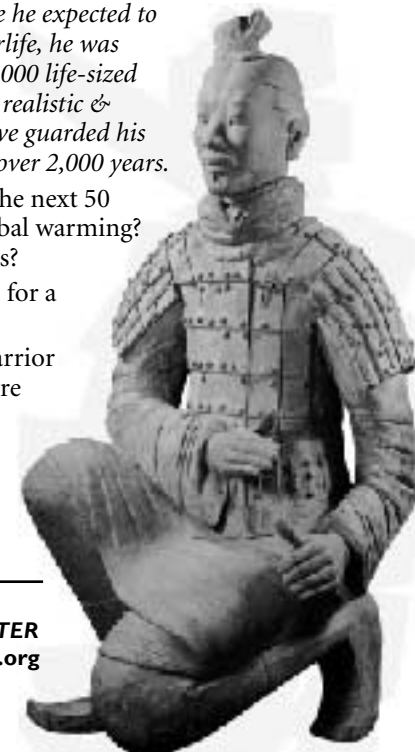
China, Xian, Shaanxi Province; Kneeling Warrior ; c. 215 B.C. Ceramic; Mausoleum of Emperor Qin Shi Huang