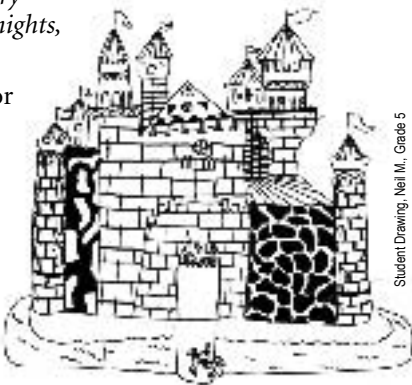
Student Drawing, Neil M., Grade 5