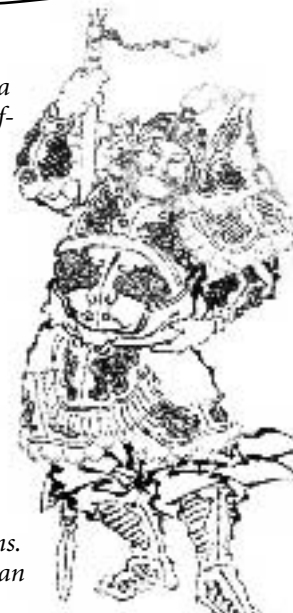
Anonymous (Japanese) Untitled; Drawing, 24 x 15.2 cm (sheet) Fine Arts Museums of San Francisco, A049009