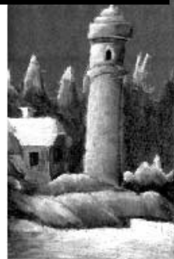
Student artwork, grade 6