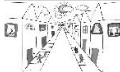
Student artwork, grade 3

Robert Bechtle draws every angle of his paintings correctly. He uses perspective techniques to show cars & buildings realistically. Use perspective to draw your house, street or car in realistic detail.