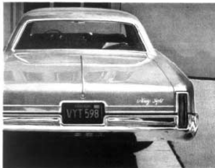
Robert Bechtle, b. 1932, '68 Oldsmobile, 1969, Color Lithograph, 21.6 x 27.8 cm (image); 33.1 x 43.4 cm (sheet) Fine Arts Museums of San Francisco, Museum purchase by Exchange, 1971.31.10, © Robert Bechtle