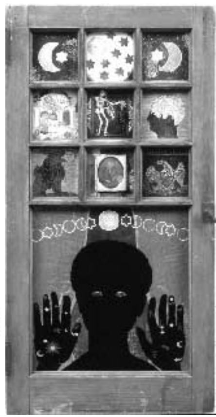
Betye Saar, Black Girl's Window , 1969 Mixed Media assemblage, 35 1/4 x 18 x 1 1/2 in., Collection of the artist Courtesy of Michael Rosenfeld Gallery, LLC, New York, NY