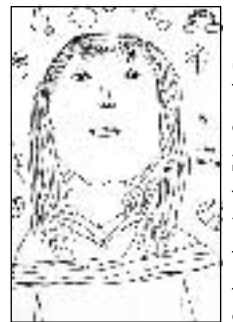
Student drawing by Erica S. grade 5

Learn more about Betye Saar at: www.ackland.org/art/exhibitions/saarwebsite/exhibition_page.html