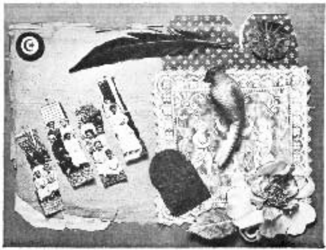
Betye Saar, Keep for Old Memoirs , 1976, Los Angeles County Museum of Art, Cirrus Editions Archive. Purchased with funds provided by the Director's Roundtable, and gift of Cirrus Editions Photograph ©2007 Museum Associates/LACMA, M.86.2.531 Courtesy of Michael Rosenfeld Gallery, LLC, New York, NY

Betye Saar (b. 1926) draws from her own personal heritage, African American, European & Native American, as she creates assemblages, artworks that combine bits & pieces of objects in new & meaningful ways. Invariably, her artwork combinations bring a different perspective on the deeper contemporary issues of race, gender, culture & religion. A sensitive & committed artist, Saar reminds us of our universal connections to family, memories & spirituality.