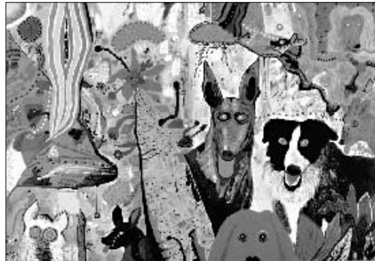
Roy De Forest, Country Dog Gentlemen , 1972, polymer on canvas, 66 3/4 in. x 97 in. (169.55 cm x 246.38 cm) San Francisco Museum of Modern Art, Gift of the Hamilton-Wells Collection 73.32, © Estate of Roy De Forest/ Licensed by VAGA, New York