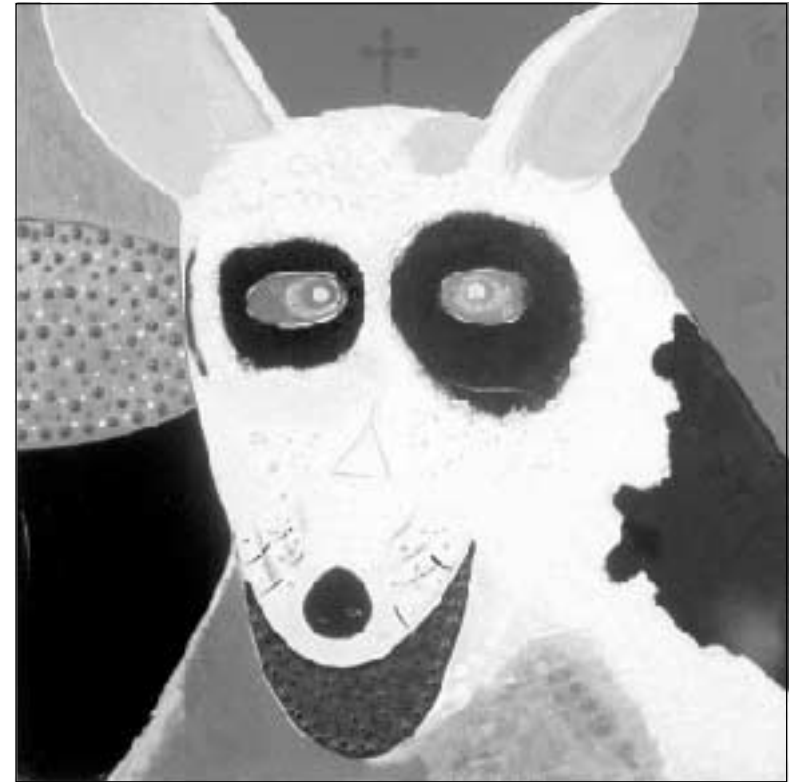
Roy De Forest, Fred , 1978, Varnished polymer on canvas, 30 x 30.38", Courtesy of the di Rosa Preserve, Napa, California. Photo: Steffen Kriebitz, © Estate of Roy De Forest/ Licensed by VAGA, New York